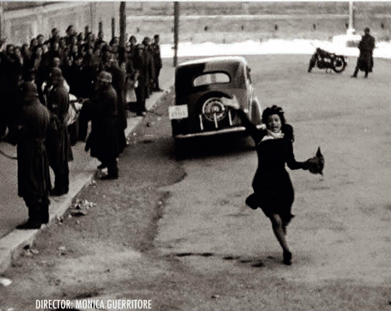
DIRECTOR: MONICA GUERRITORE

The public had identified with Anna, a pure Roman heroine, a proud and courageous expression of all Italy"